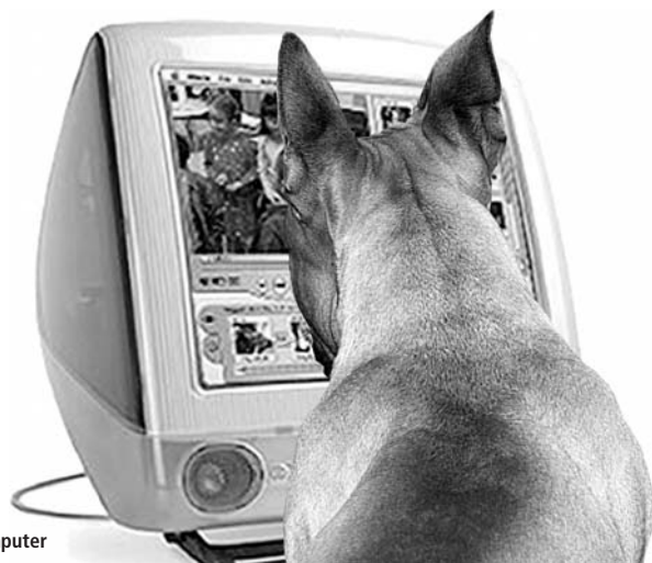
Special @ the computer

Some of the ones below are the online equivalents or extensions of existing magazines-whether consumer or specialist. In newsagents, they are prohibitively expensive, starting at about $10 and up to $20 a copy. While not all of their content and fascinating advertising for specialized products are on their sites, they still provide a preview of what's about to land on our side of the pond and where the pet world is spinning to.