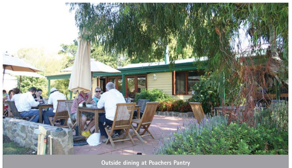
Outside dining at Poachers Pantry

The elegant accommodation includes two queen size Deluxe rooms and two cosier queen rooms. The rooms are tastefully decorated, are filled with antiques and have ensuite bathrooms. House trained and well mannered dogs are allowed to sleep in your rooms but are not allowed into the common areas—the large guest sitting room downstairs and the smaller sitting room upstairs.