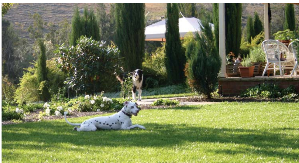
Enjoying the lush lawn with new friends