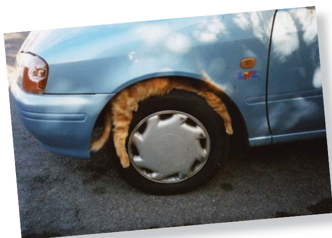
Asleep at the wheel

Well we certainly got a chuckle out of Mac's new nap spot. Which reminds us to remind you that we are on the hunt for new talent to be shot and appear in future editions of Urban Animal. See our article on page 34. We're always looking for pets who aren't shy about hamming it up in front of the camera. Ideally we look for pets who have close inter-species relationships. Small digital images under 100K or 600-800 pixels wide should be sent to artwork@urbananimal.net