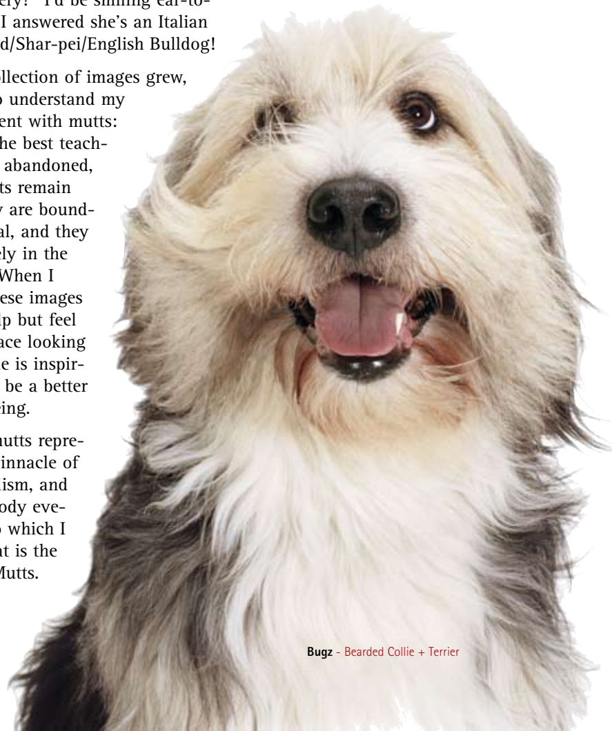
Bugz - Bearded Collie + Terrier