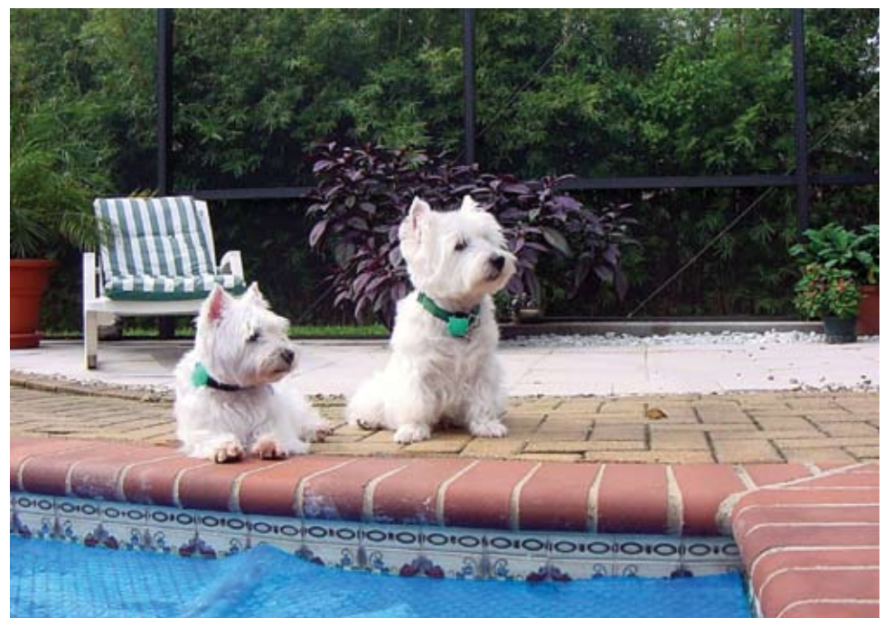
Two Water-Wise Westies