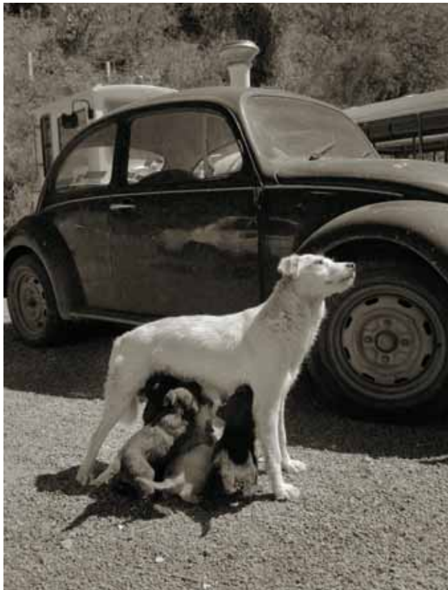
A scrappy mother nurses her litter of puppies