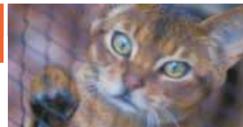
Strong, safe, protective. Caboodles avail.

Request more information today and you'll receive a FREE information kit that includes photos of Catmax enclosures to inspire your own design!