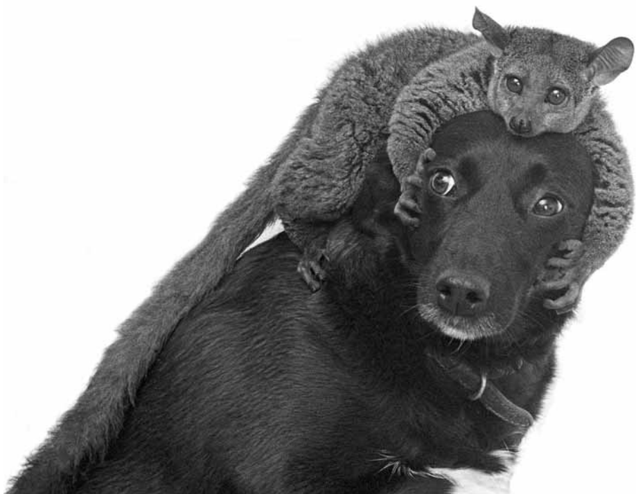
Clinging Companions, 1969

ple are killed by hippos in Africa than by any other animals. Still, I used to paddle around to the extent of the rope, and thought it great fun. One day, a very young hippo started scratching its back underneath the canoe, rocking it backwards and forwards. Everyone noticed this very quickly and started throwing stones at it and hauled me in. It was a bad moment for my parents, for had I fallen in the water there would have just more than just a baby hippo to contend with – there would have been all the others as well. I didn't think much of it – all in a day's work, really, as I was about six at the time."