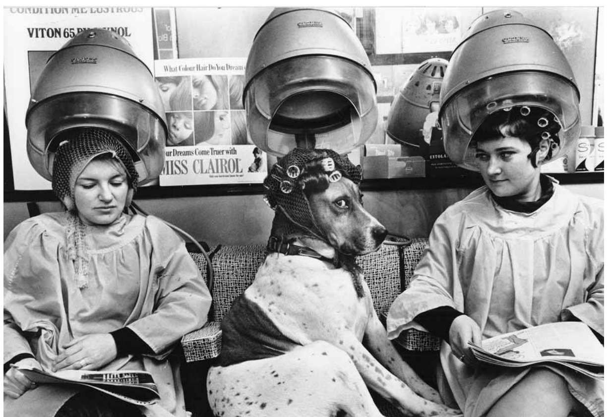
Canine Coiffure, 1969

"Animals are such agreeable friends - they ask no questions, they pass no criticisms." - George Elliot