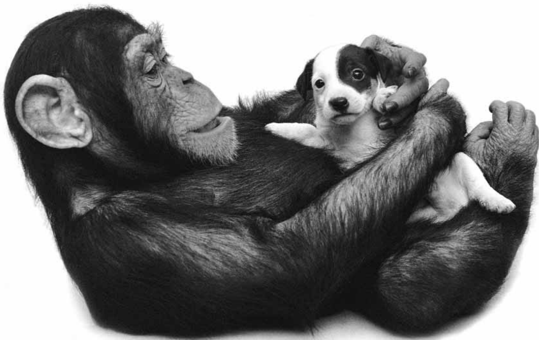
Puppy-Loving Chimp, 1970