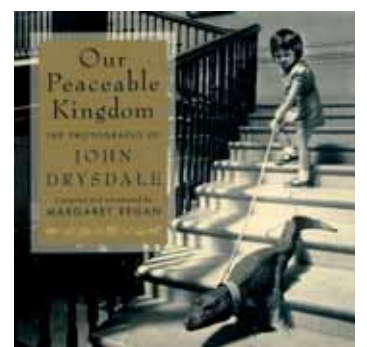
"Our Peaceable Kingdom"