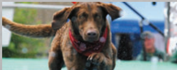
BIG AIR DOCKDOGS

Showcases the skills of dogs who think catching plastic is fantastic. Our Frisbee dogs get 90 seconds to score as many points as possible by catching long throws into the Bonus Zone. These are the coolest dogs!