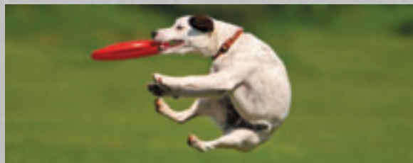
VOLVO CARS CANINE DISC

Flyball is a relay race between two teams of four dogs. Racing side by side, one dog from each team must go over four hurdles, trigger a ball from the flyball box, catch the ball and then return over all four hurdles to the start finish line where the next dog goes. The fastest dogs in Australia will do the 30 meter course up and back in 4 seconds flat and the 4 dog team will complete the course in under 18 seconds. This is hilarious!