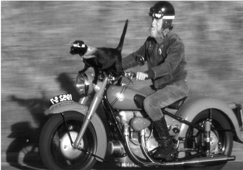
Rastus and Max