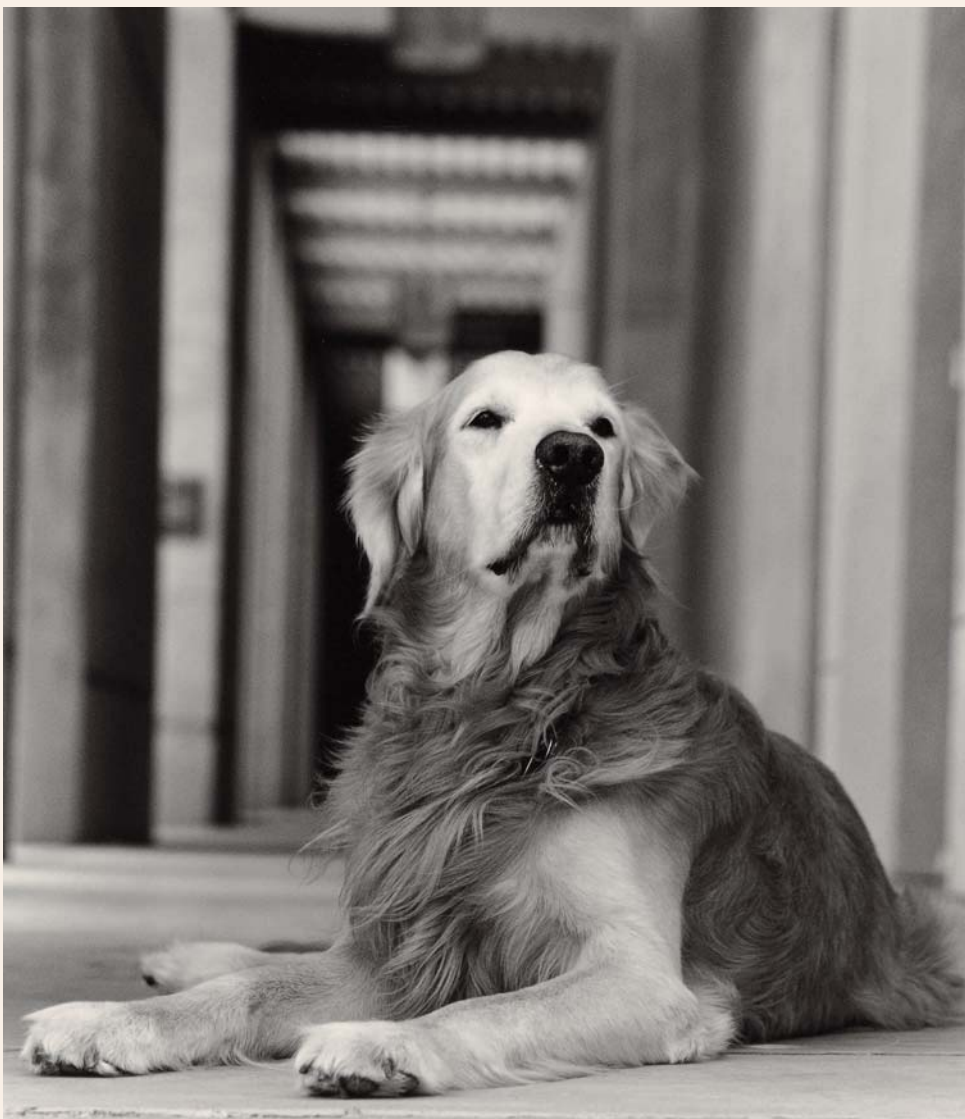
Lio, 11 years old

Longevity Secret - checking out the finely perfumed ladies