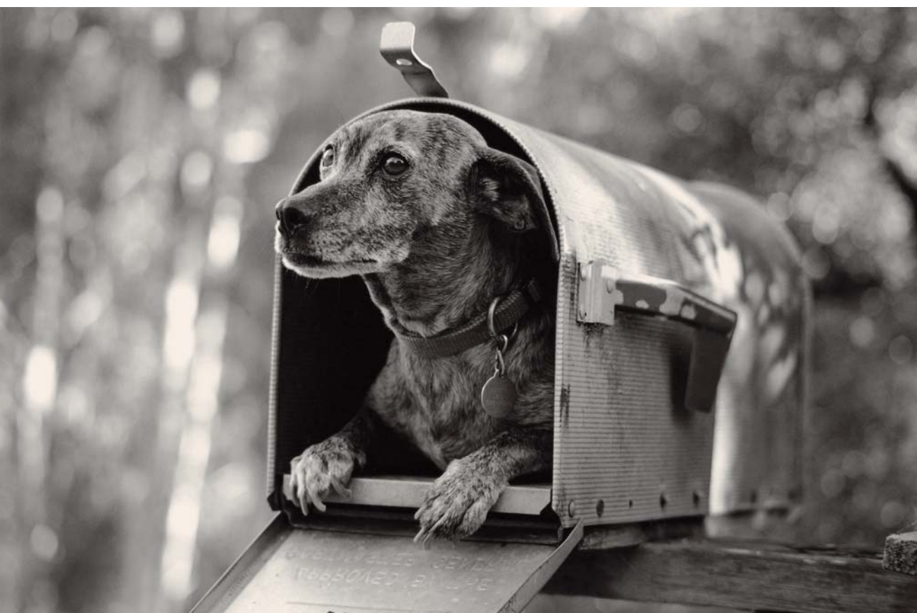
Ollie, 10 years old (top) - Longevity Secret - Long, slow walks with time to sniff This old fellow was still spry enough to be romping at the dog park.