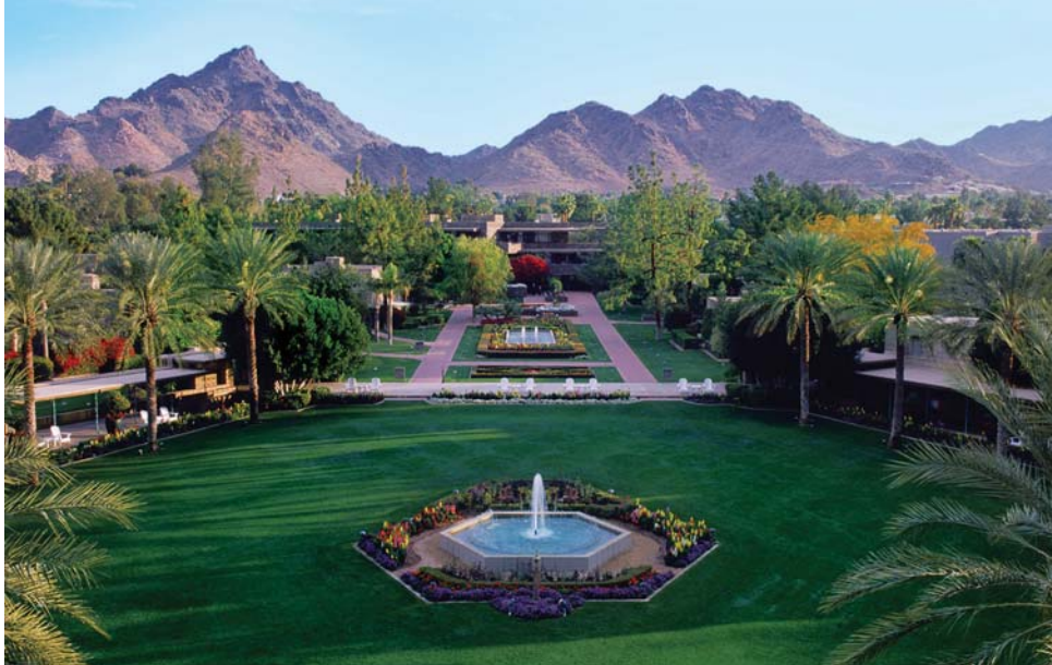
The lawn at the Biltmore Resort

Editor's note: Urban Animal would like to know of your favourites so that we can look at reviewing more great places in the coming issue. We pay our own way, do not let the operator know we are coming to review it and accept no perks or favour advertisers. If a property is deemed not acceptable, it's not reviewed.