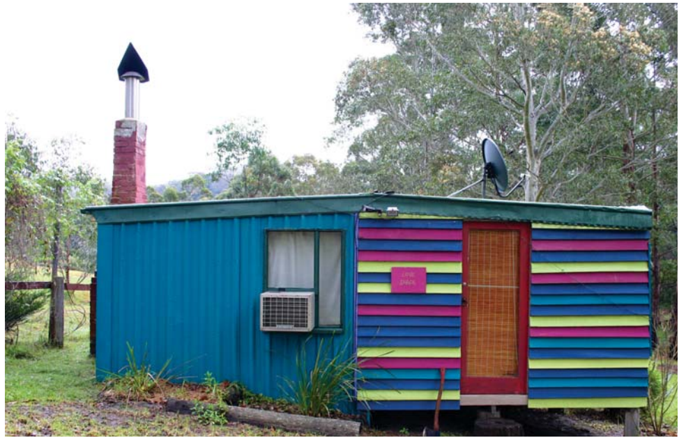
Local favourite the Love Shack at Milton

My friends believe I'm lucky to be a travel writer, thinking staying in hotels around the world, flying to exotic locations and reporting on local attractions is a cool job. Though I have written for countless newspapers, many airlines' in-flight magazines, womens and travel publications and even Business Review Weekly on upmarket accommodation, give me a place on the beach with the dog any time. Oh and my wife too!