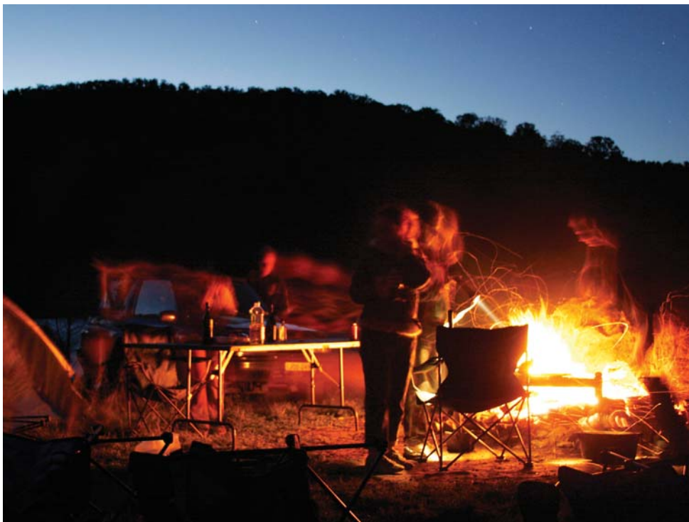
Camping on a Paw Wheel drive adventure.

As for keeping your dog inside, there was a specific sign in the house that they were not allowed on beds or furniture, but the area they could sleep in was a laundry, small, hot, dank and only leading to that unfenced yard if they had to go out at night. Finally, it was only a little more than half a kilometre as the crow flies in a straight line to where you could see the beach and then another 200 metres down a hill to touch water, but to walk safely to that point was not direct. You had to wend your way up and down steep streets with cars zooming by. Hardly pet-safe for an easily distracted and selectively deaf Beagle!