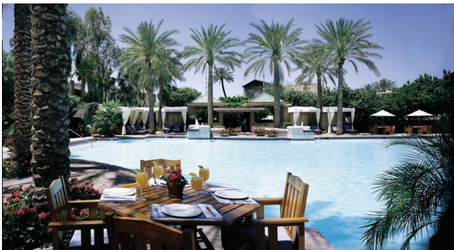
Poolside at the Biltmore Resort