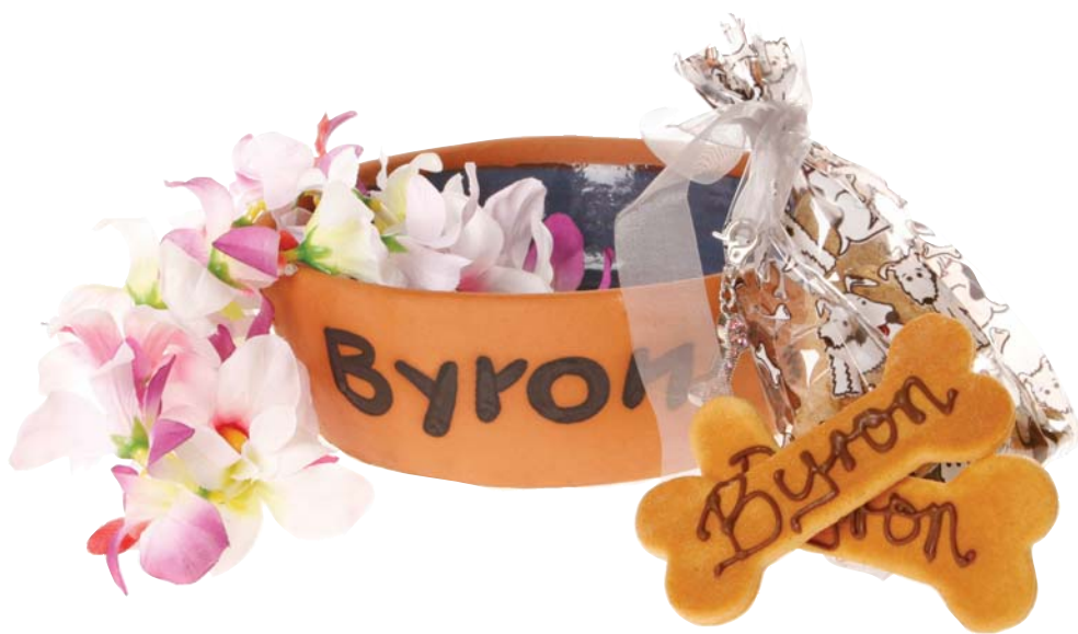
Individualised bowls kindly supplied by Studio Sebastian ph: 9670 1571, cookies by Delicious Delights 4 Decadent Dogs ph: 9817 6909