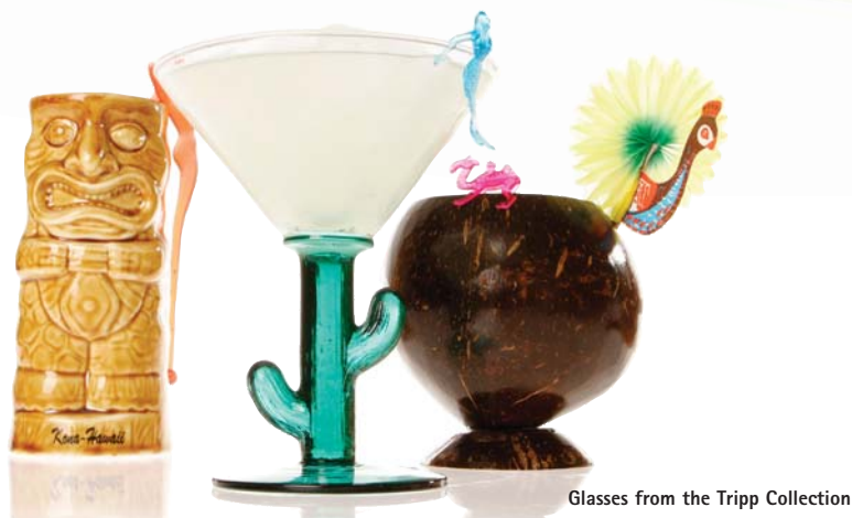
Glasses from the Tripp Collection