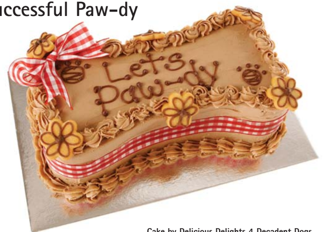
Cake by Delicious Delights 4 Decadent Dogs

Mix the dry ingredients. Add the remaining ingredients and mix quickly. Bake in a greased ring baking tin at 180 degrees for 40 minutes. You may ice this cake with low fat cottage cheese, flavoured with peanut butter and decorate with some carob shavings. Store in the refrigerator.