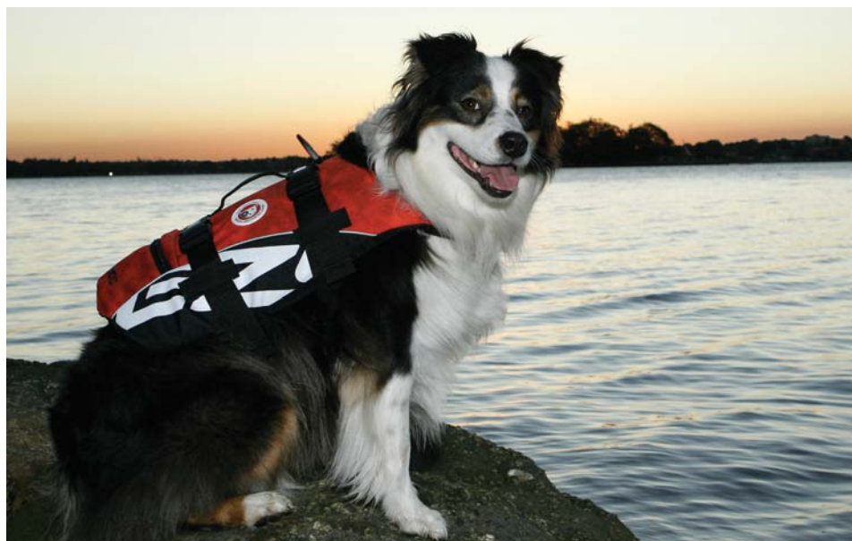
SEADOG safety vest by EZYDOG

Stockton Beach - James Patterson Road This is a 37km beach. The first 500m is on lead whilst the rest is off lead until the Newcastle section of the beach- 30kms of the beach is off lead.